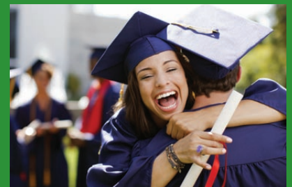
HS DIPLOMA - PAGE 6