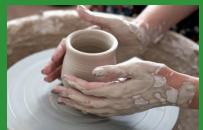
FEE BASED COURSES - PAGE 15