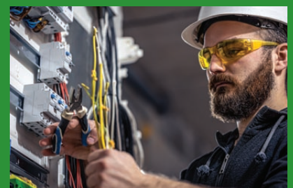
CAREER TECH - PAGES 8 - 14