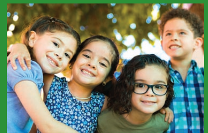
PARENT EDUCATION - PAGE 7