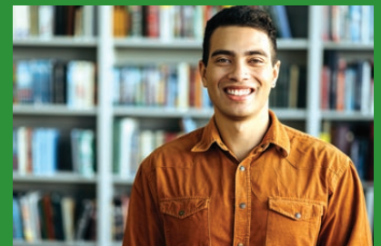
ESL - PAGE 5